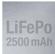
Powerful rechargeable lithium-iron-phosphate battery