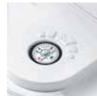
Integrated compass to help find south-facing position