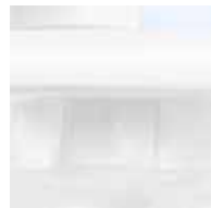
Intelligent sensor with Fresnel lens