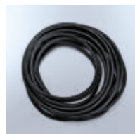
Including extension lead (for XSolar L-S only)