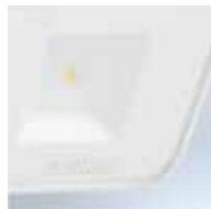
Innovative LED system