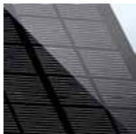
High-quality monocrystalline glass solar panel