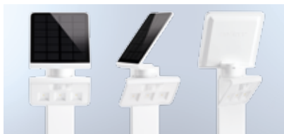
Solar panel turns through 330 degrees and LED panel 120 degrees