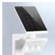
Optional basic light level 3%