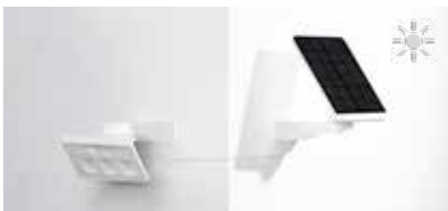
Solar panel and LED panel can be mounted separately (for XSolar L-S only)