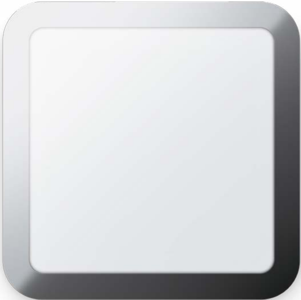
RS LED D2